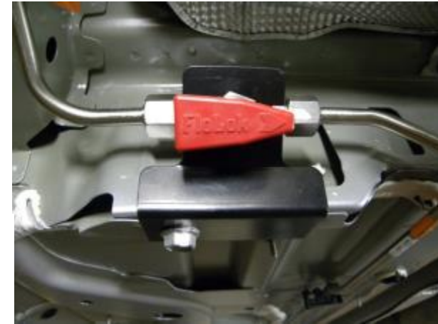
Manual Fuel ¼-Turn Shut-Off Valve ON, allowing fuel flow