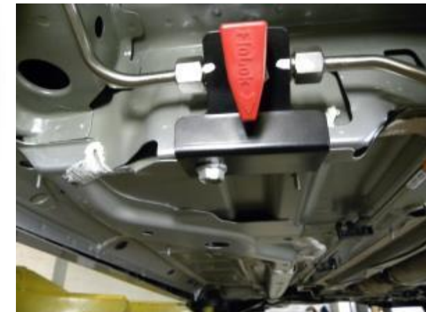
Manual Fuel ¼-Turn Shut-Off Valve OFF, preventing fuel flow